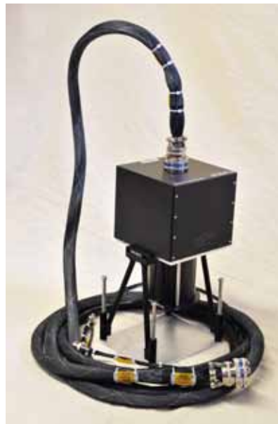
Target Assembly with Interface cable